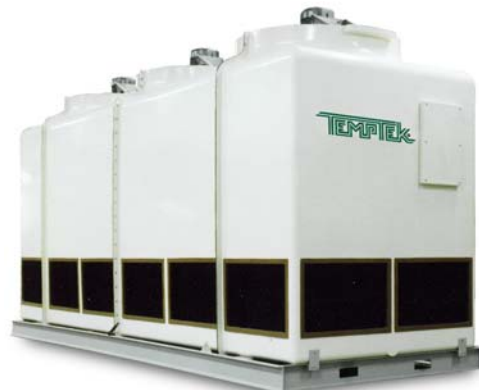
Pictured: 405 ton TP Series cooling tower